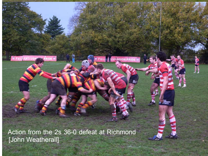
Action from the 2s 36-0 defeat at Richmond